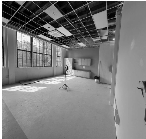
Continue with classroom VCT and casework install throughout