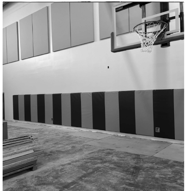
Sound absorbing wall panel and wall pads installation complete