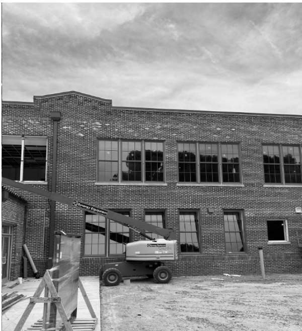
Exterior window install is 70% complete